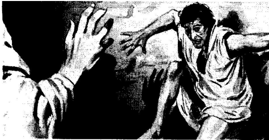
"He commands even the unclean spirits. . . ."

Reflection: A mob of London protesters grew restless. The tension mounted by the minute. It was like watching a balloon expanding beyond its capacity to stretch. The police stood by waiting for the explosion.