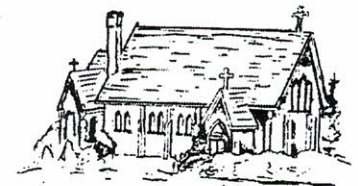
St. Anthony's Church

Good Stewards of all That God has given us.